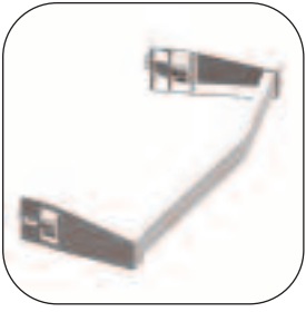
P662A0701 Horizontal Accessory Rail