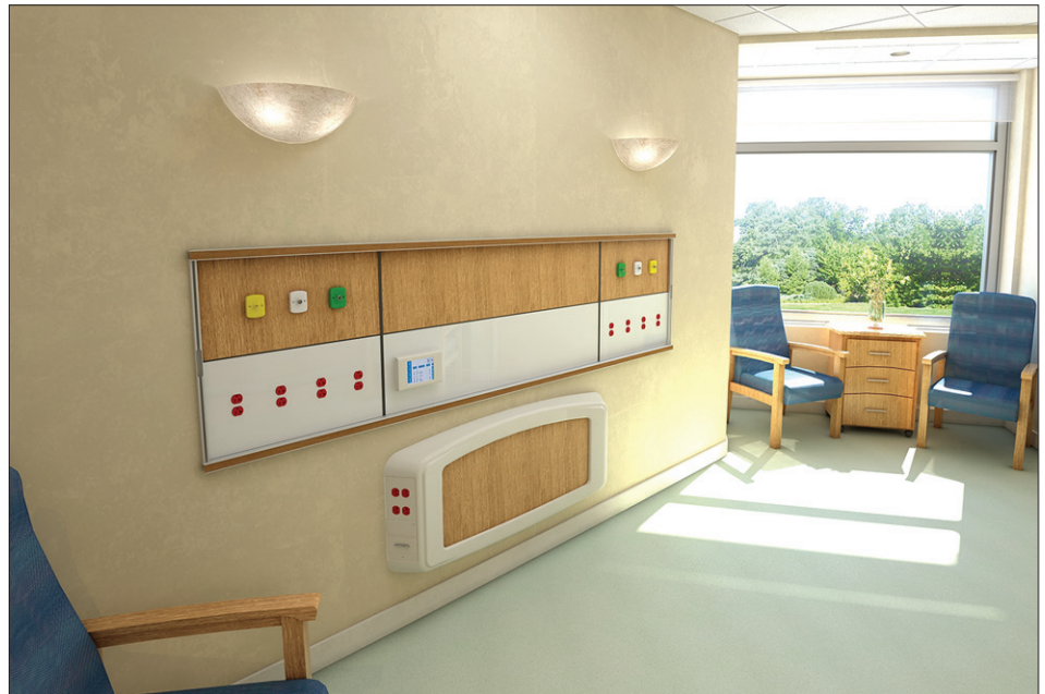
Basis In-Wall Horizontal with Bed Locator

An electrical J box supports normal, low