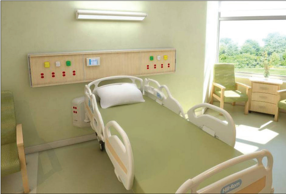
Basis On-Wall Horizontal with Integriss® Light and Bed Locator