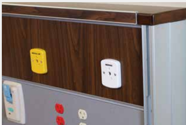
Solid Wood Trim