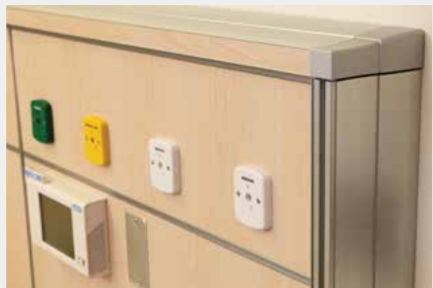
Anodized Aluminum Trim