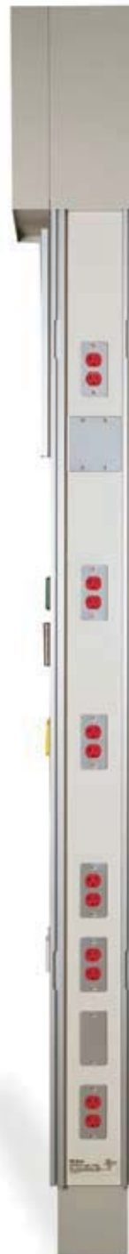
Small Power Column Side View