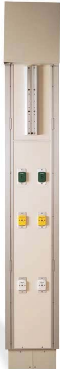
Small Power Column Front View